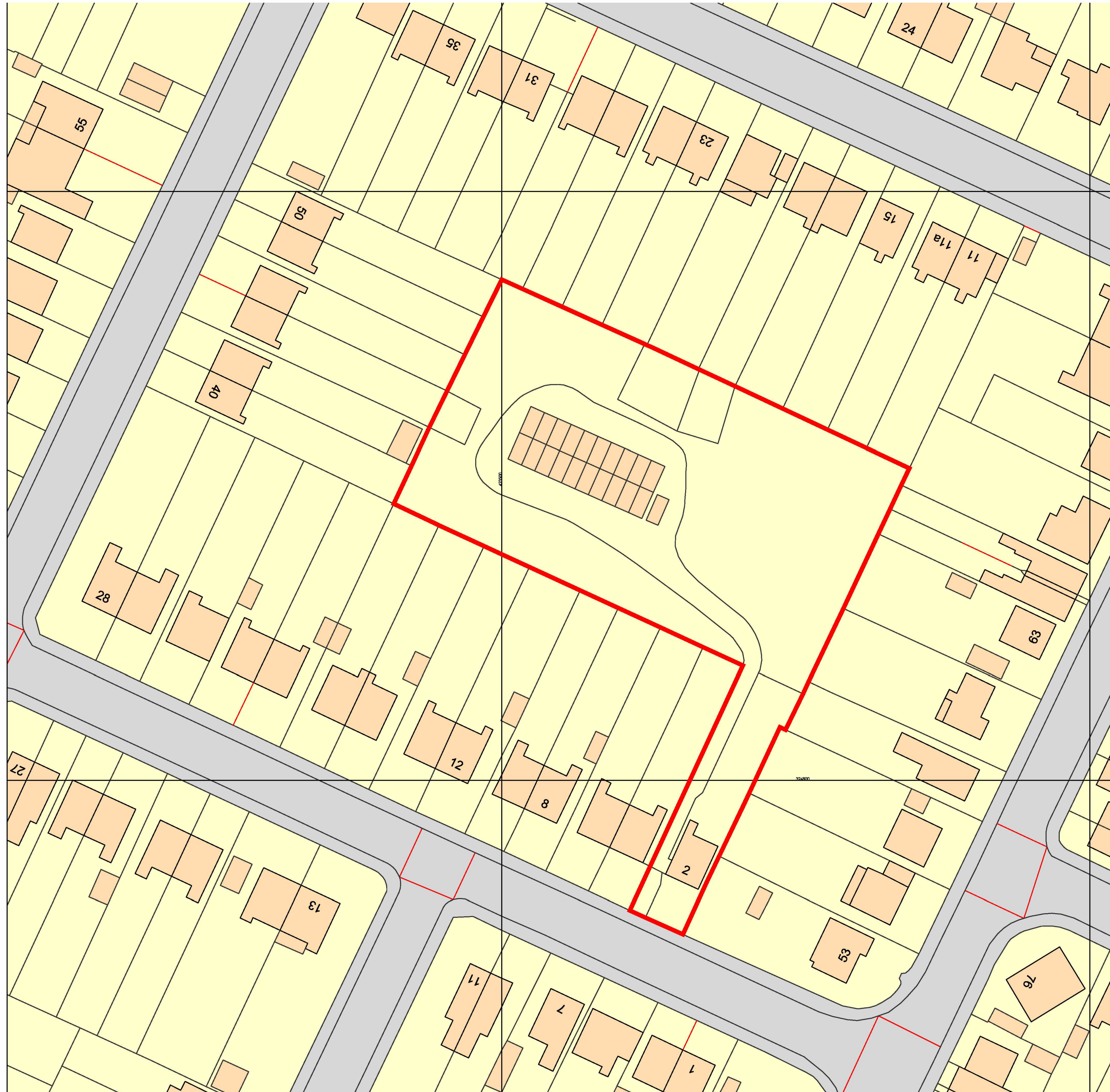
All rights reserved. Licence number 100022432